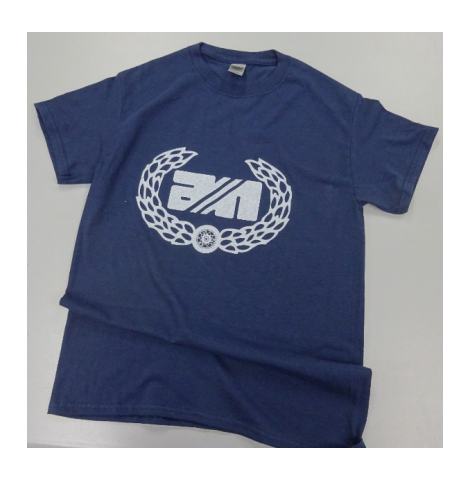
ANDOVER NORTON LOGO T-SHIRT Shop (S) Shop (M) Shop (L) Shop (XL)