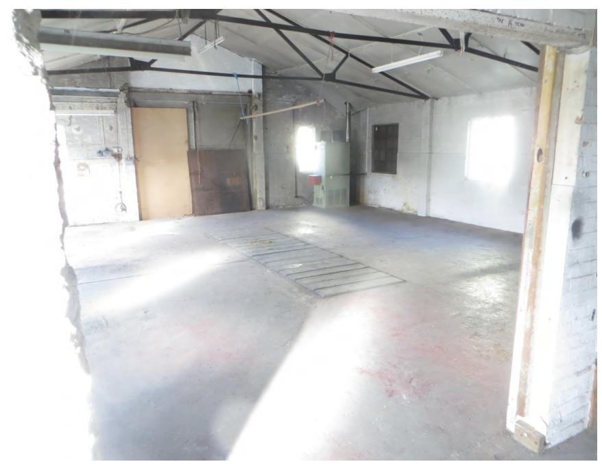
Impressive? No way, but historical ground: The Assembly Room where Factory Racers and Proddy Racers were assembled

So I got to see the birthplace of my 1970 Proddy Racer since all but a handful of late Proddies that were finished in North Way were assembled here and tested on the track which runs a few hundred yards from the building.