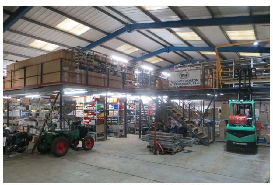
Our new mezzanine (on the right, behind the fork lift)

Our new mezzanine is now in place so our packers can work at civilized temperatures under it. That wasn't the case last winter. An added advantage is that we now have new shelves on top of it. This leads to taking our raw materials/unsorted items stores gradually down and the items now being identified, counted and located on our system.