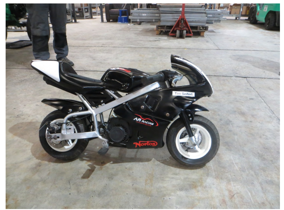
"Baby Nepomuk", c/w all transfers faithfully copied from the original. We must discuss the settings for the suspension though front and rear end feel somewhat rigid!